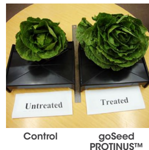
Figure 4 illustrates the benefits of goSeed PRO TINUS on green romaine lettuce head development and maturity compared to the untreated control.

goSeed PRO TINUS is available now on the following vegetable seeds; Lettuce, Tomato, Carrots, Onions & Spinach.