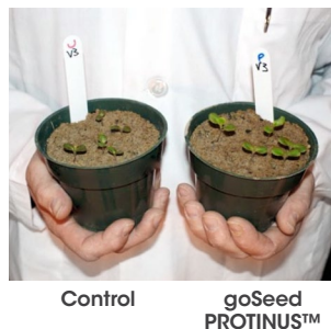
Figure 3 highlights goSeed PRO TINUS as stronger, healthier looking seedlings against the untreated control.